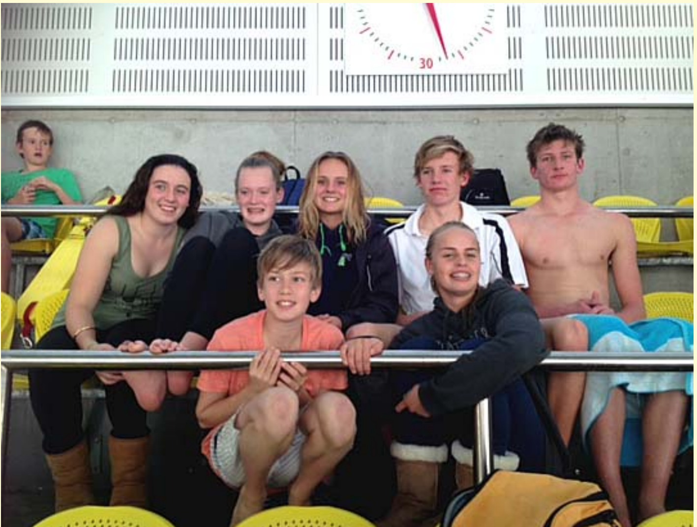
North Cronulla's NSW Pool Rescue Championships Competitors.

Abbey went out hard, with a strong finish to claim Silver in a very close race. Lachie had a great race too, also gaining Silver.