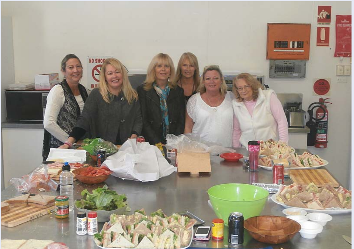
Our wonderful Ladies Committee at the Annual General Meeting 2013.